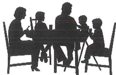
Thursday Night Community Dinners